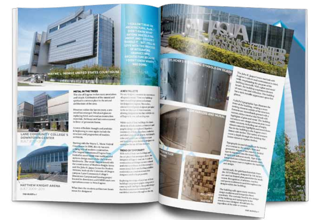
THE BLEED 4, 2013