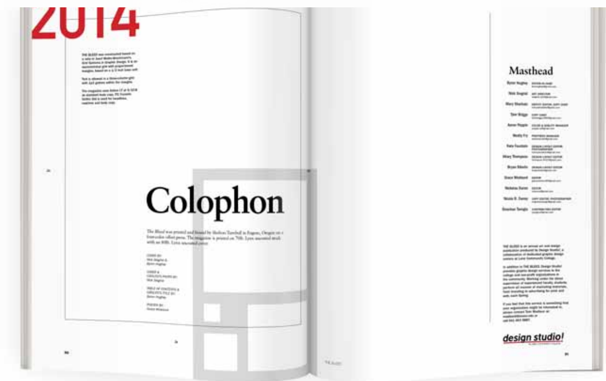
THE BLEED 5, 2014